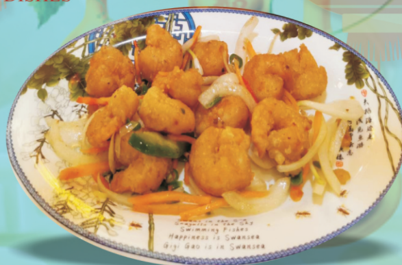
Salt&Pepper Calamari 椒盐鱿鱼 £ 17.98