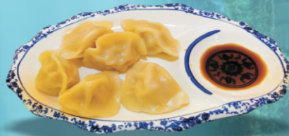
Boiled Dumplings (Veg/Pork) 素/肉饺 £ 8.98/6