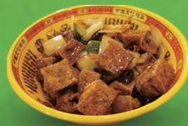
Home Style DouFu 家常豆腐 £11.98