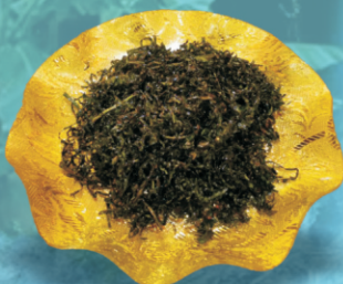
Crispy Seaweed 海草 £ 5.98

Lobster Ball, Fish Cakes and/or Fish Balls