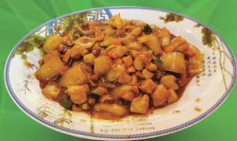
Gong Bao Potatoes 宫保土豆 £11.98