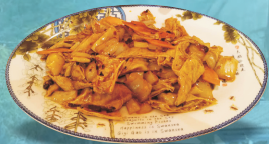
Gong Bao Bean Curd 宫保腐竹