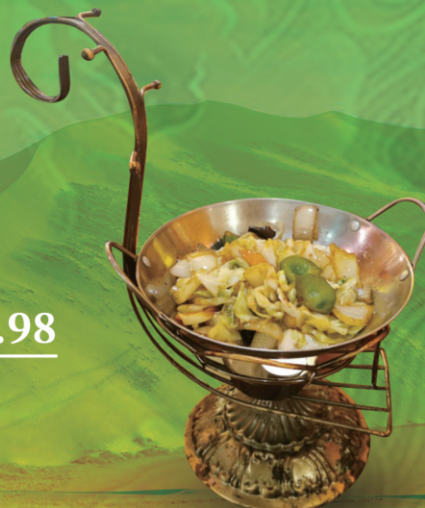
Sweet Heart Cabbage 炆炒包苾菜 £11.98