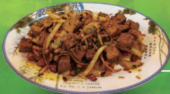
Salt & Pepper Dou Fu (Tofu) 椒盐豆腐 £11.98