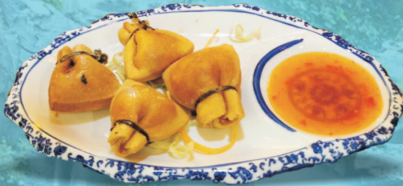
Lucky Money Bags 福袋 £ 7.98/4