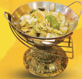
Sweet Heart Cabbage 炆炒包芯菜

If you love aubergine, then this definitely is the one for you. If you are not an aubergine fan, then you could become one by trying it. Enjoy!