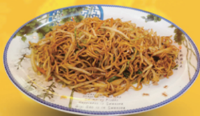
Veg Noodles 素炒面