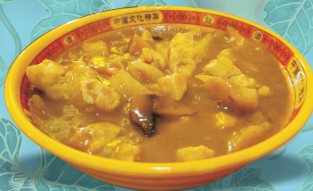
Curry Chicken 咖喱鸡 £ 12.98