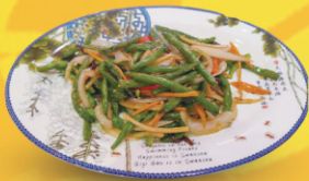
Green Beans 干煸豆角