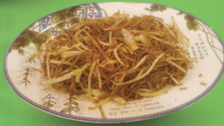
Veg Vermicelli Noodles 蔬菜粉丝面 £12.98