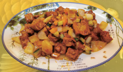
Satay DouFu / Potatoes / Beancurd 沙爹豆腐/土豆/腐竹