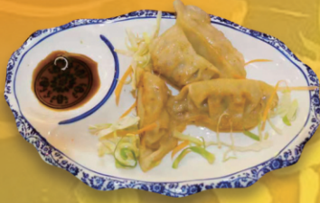
Griddled Veg Dumplings 素锅贴