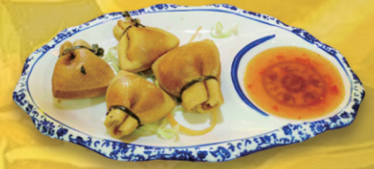
DouFu (Tofu) Lucky Money Bag 福袋