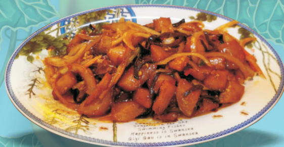
YuXiang Potatoes 鱼香土豆 £ 11.98