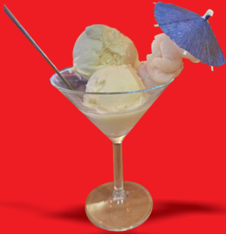
冰激凌 Joe's Ice Cream & Lychees (荔枝) £6.98