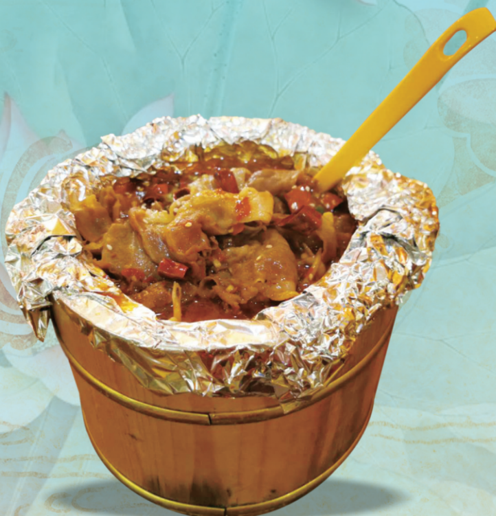
Barrel Pork 水煮肉片 £ 20.98

Pork in spicy soup with vegetable. It's a big portion, so if you can't finish with it next day add your favourite vegetables in, still delicious. Best eating Is with rice. Appreciate your patient it being cooked delicately.