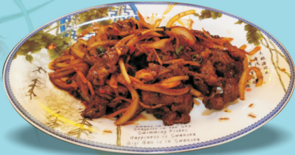
Hot & Spicy Lamb 香辣羊肉 £ 16.98