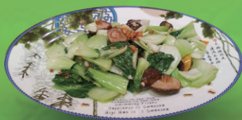
Pak Choi & Mushrooms 香菇油菜 £11.98