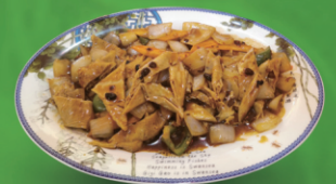
Black Bean Beancurd 豆豉腐竹 £11.98