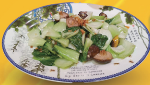
Pak Choi & Mushrooms 香菇油菜

A totally different way of cooking. Totally different taste. The dry chillis just adding taste but are not actually spicy.