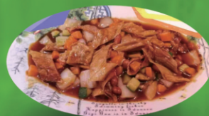
Gong Bao Peanuts Beancurd 宫保腐竹 £11.98