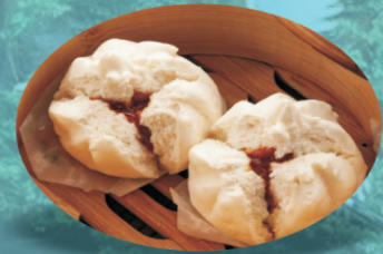
BBQ Pork Bao (Char Siu Bau) 叉烧包 £ 8.98/2