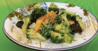
Garlic Broccoli 蒜蓉西兰花 £11.98