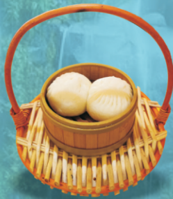
Tian Jin Bao (Veg) 天津包 £ 8.98/2