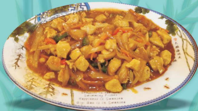
◀ Satay Chicken 沙爹鸡 £ 13.98