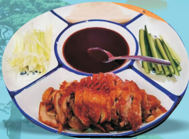
Beijing Roast Duck 烧鸭 £ 14.98

6 Rice Pancakes, Quater Duck, Cucumber, Leek, Duck Sauce