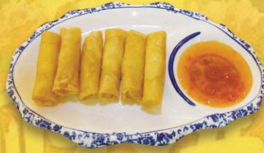
Veg Spring Roll 春卷