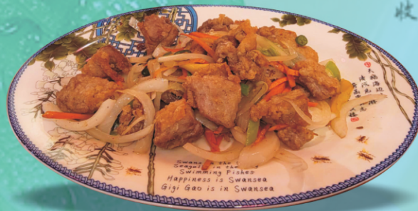
Salt&Pepper Duck 椒盐鸭 £ 15.98