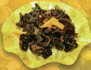
Crunchy Mushroom Salad 拌木耳