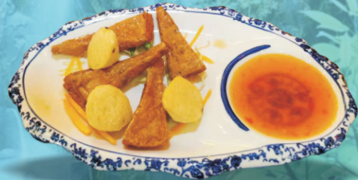
Mixed Fish DouFu 鱼丸鱼饼 £ 9.98

Lobster Ball, Fish Cakes and/or Fish Balls