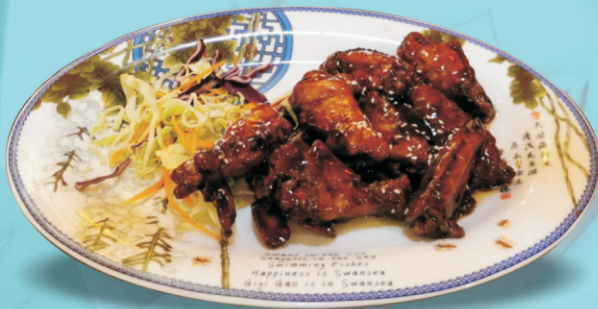
Coke chicken 可乐鸡 £ 13.98 Contain Bones