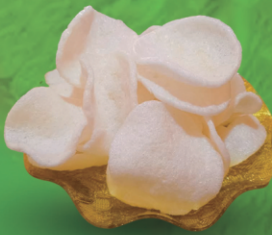
Prawn Crackers 虾片 £4.98