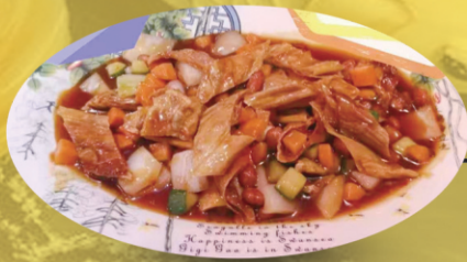
GongBao DouFu / Potatoes / Beancurd 宫保豆腐/土豆/腐竹

Beancurd is a misnomer; it is actually soybean milk skin, made by lifting away the sheet that forms on the surface of heated soy milk. The sheet can be dried in flat form, or bunched up into bundles. In Chinese cuisine, the skins are a mainstay of the vegetarian diet, though I've never known a meat eater who didn't like the half-tender, half chewy texture of the product. It's not only my favorite food But for most Chinese which used in lots dishes, either vegetable or meat dishes. Some customer was confused it as meats by the appearance and taste. But, don't worry, it's PURE VEGAN and very healthy food.