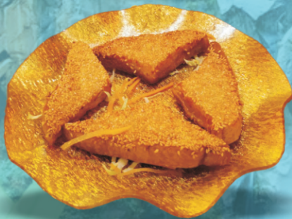
Prawn Toast 虾多士 £ 8.98/4