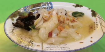
Chinese Cabbage 大白菜 £11.98