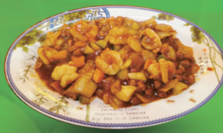
Gong Bao King Prawns 宫保虾仁 £17.98