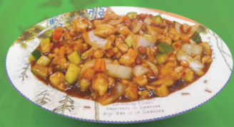
Gong Bao Chicken 宫保鸡 £13.98