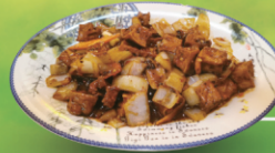
Black Bean DouFu (Tofu) 豆豉豆腐 £11.98