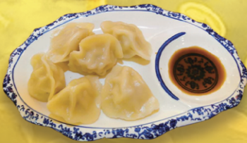
Boiled Veg Dumplings 素水饺