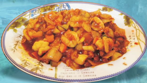
Gong Bao King Prawn 宫保虾仁