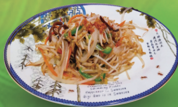
Favourite Bean Sprouts 豆芽 £10.98