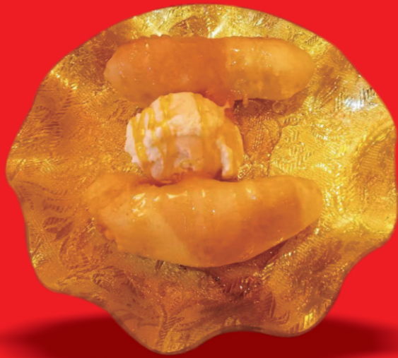
拔丝香蕉 Bananas Fritters (subject to availability during peak hours) £7.98