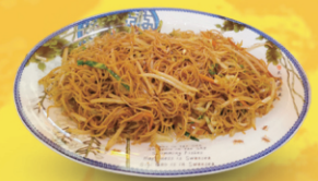
Plan/Veg Vermicelli Rice Noodles 素炒米粉