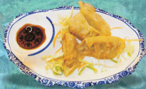
Griddled Dumplings (Chicken/Veg) 素/鸡锅贴 £ 7.98/4