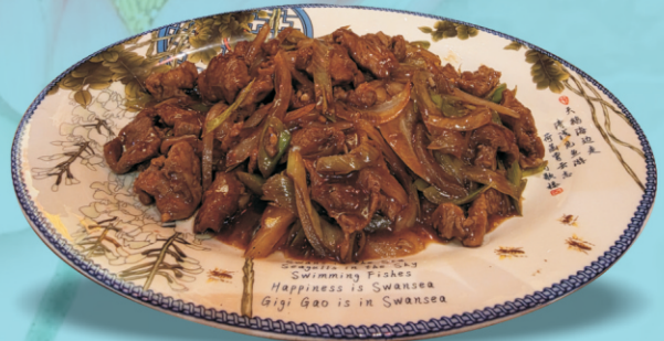
Lamb & Leeks 葱爆羊 £ 16.98