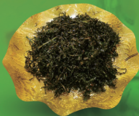
Crispy Seaweed 海藻 £6.98