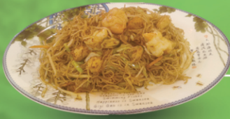
Seafood Vermicelli Noodles 海鲜粉丝面 £14.98