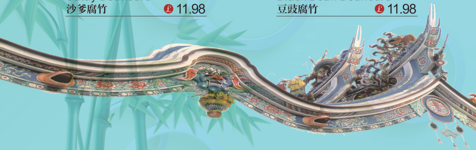
Black Bean Beancurd 豆豉腐竹 £ 11.98