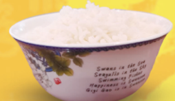
Plain Jasmine Rice 白饭