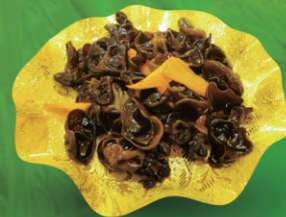
Crunchy Mushroom Salad 凉拌木耳 £9.98