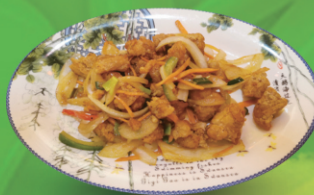
Salt & Pepper Chicken 椒盐鸡 £13.98