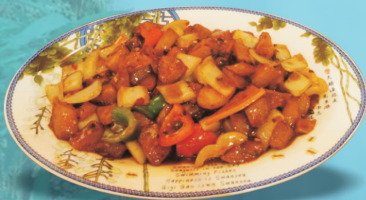
Gong Bao Potatoes 宫保土豆