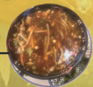
Sweet corn soup 粟米汤

Vegs, Peas, Sweet Corns, Bamboo Shoots, Crunch Mushrooms.