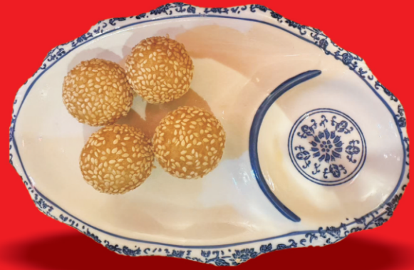
红豆沙芝麻 Red Bean Sesame Balls £6.98/4 pieces