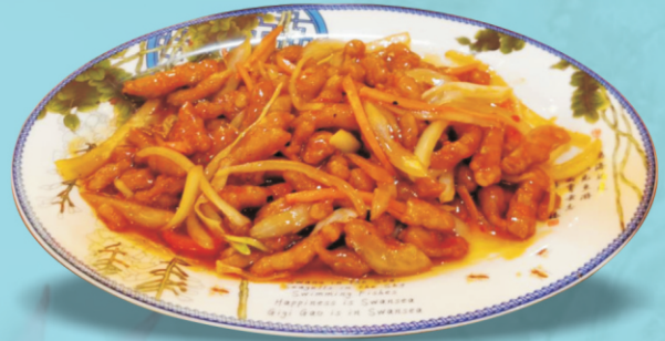
Crispy Chicken 脆鸡丝 £ 13.98