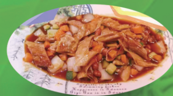
Gong Bao Beancurd 宫保腐竹 £11.98