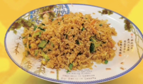
Veg Rice 素炒饭