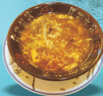
Sweet Corn Soup 粟米羹 £ 7.98 My favourite Soup When I was in China... Sweetcorn & Egg (Let Us Know if you prefer without Egg) :):)