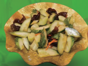
Lazy Cucumber Salad 青瓜沙拉 £5.98