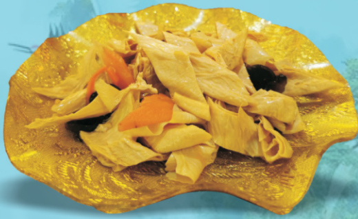
Beancurd Salad 凉拌腐竹 £ 7.98