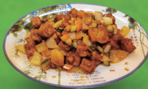
Gong Bao DouFu 宫保豆腐 £17.98