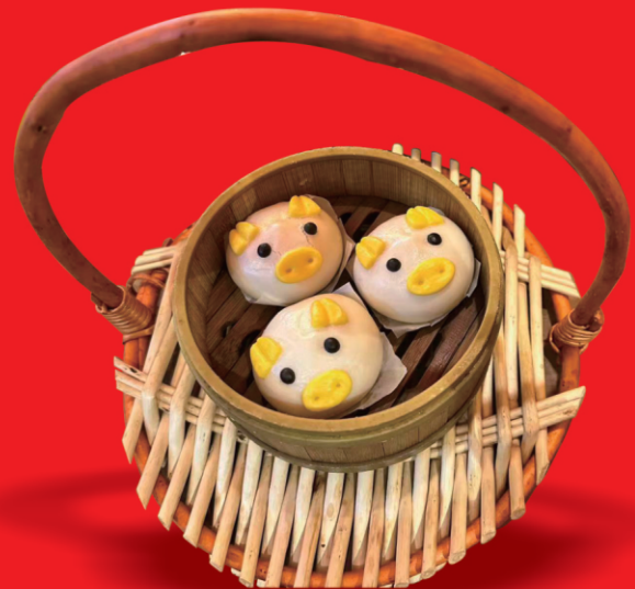
奶黄包 Custard Bao £6.98/3 pieces