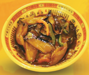
Stewed Aubergine 烧茄子