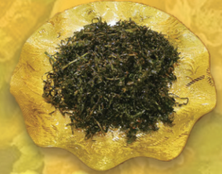
Crispy Seaweed 海藻