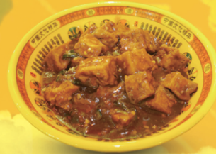
MaPo DouFu(Sping Tofu)/Homemade Tofu 麻婆豆腐/家常豆腐

My must order dish when I am in China favourite dish till now. Pac Choi has become more and more common in supermarkets in the UK, and many other countries. Matched perfectly with Chinese black mushroom (Shiitake 香菇 XiangGu)