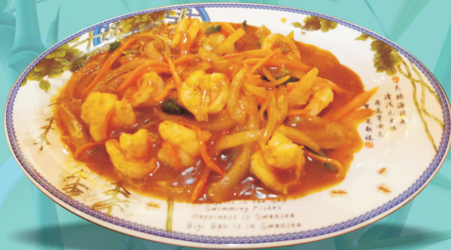
◀ Satay Prawns 沙爹虾 £ 16.98