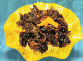
Crunchy Mushroom Salad 拌木耳 £ 9.98