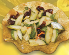
Lazy Cucumber Salad 拍黄瓜