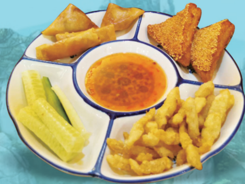
Mixed Starter (Spring Rolls+ Samosa+Sesame Prawn Toast+Crispy Chicken+ Cucumber) £ 12.98

6 Rice Pancakes, Quater Duck, Cucumber, Leek, Duck Sauce