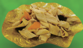
Bean Curd Salad 凉拌腐竹 £7.98