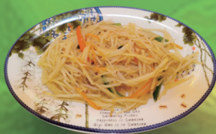
Potato Shreds 土豆丝 £11.98