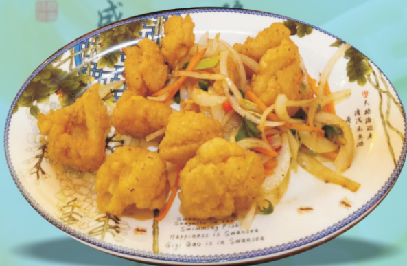
Salt&Pepper King Prawns 椒盐大虾 £ 17.98