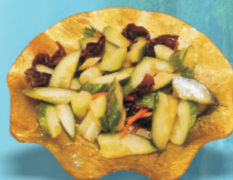
Lazy Cucumber Salad 拍黄瓜 £ 6.98