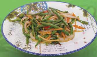
Green Beans 炆炒四季豆 £11.98