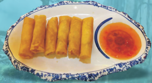
Veg Spring Roll 春卷 £ 7.98/6