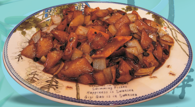
Black Bean Potatoes 豆豉土豆 £ 11.98 ▶