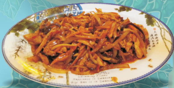
YuXiang Chicken 鱼香鸡丝 £ 12.98

YUXIANG IS A MIXTURE OF CHINESE CUISINE WHICH IS WIDELY POPULAR FOR MOST CHINESE PEOPLE. Chion / Carrots / Bamboo Shots or pepper