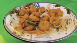
Salt & Pepper King Prawns 椒盐大虾 £17.98