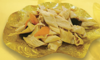
Bean Curd Salad 凉拌腐竹