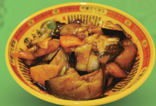
Three Freshes 地三鲜 £11.98