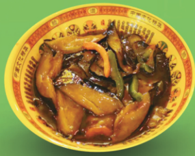
Stewed Aubergines 烧茄子 £11.98